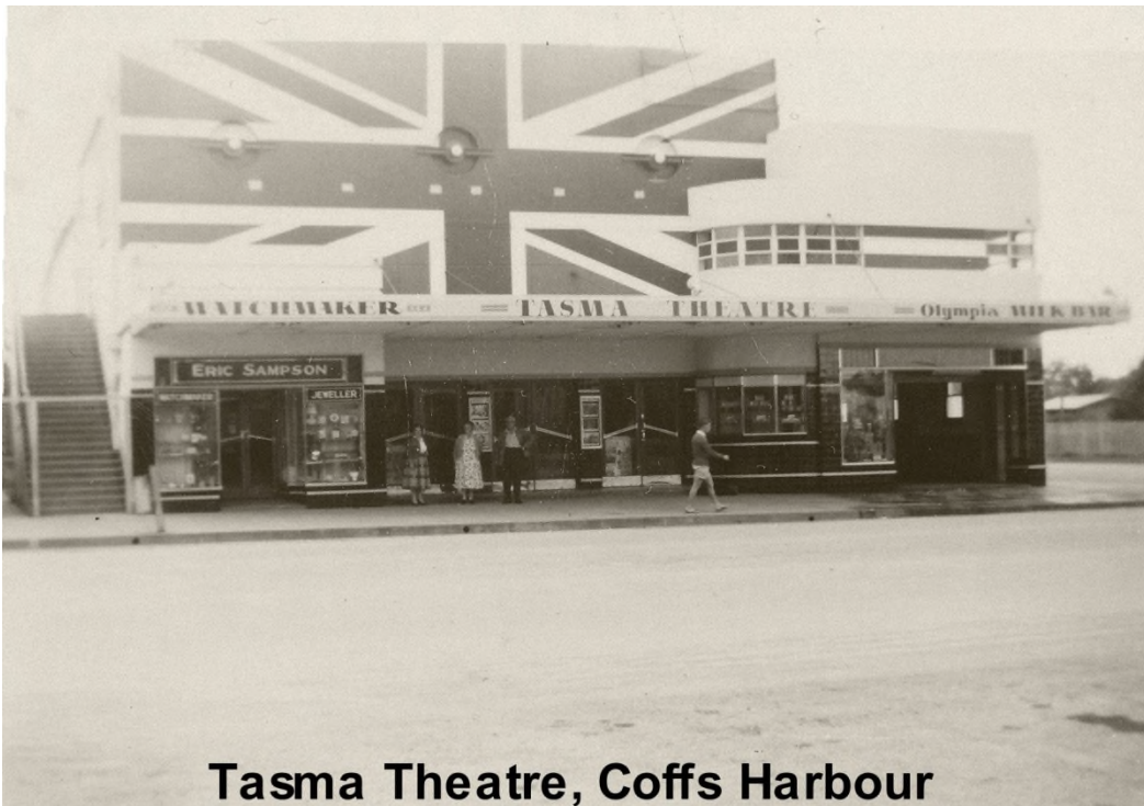
Tasma Theatre, Coffs Harbour